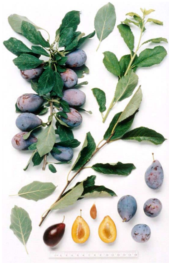
Sutter prune fruit and foliage

November 15, 2006 University of California, Davis Department of Plant Sciences