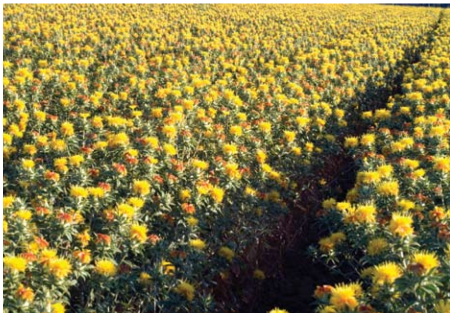
Safflower in commercial production near Davis.