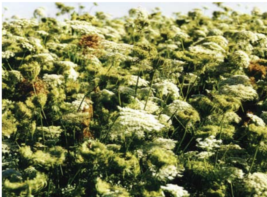
Carrot seed production