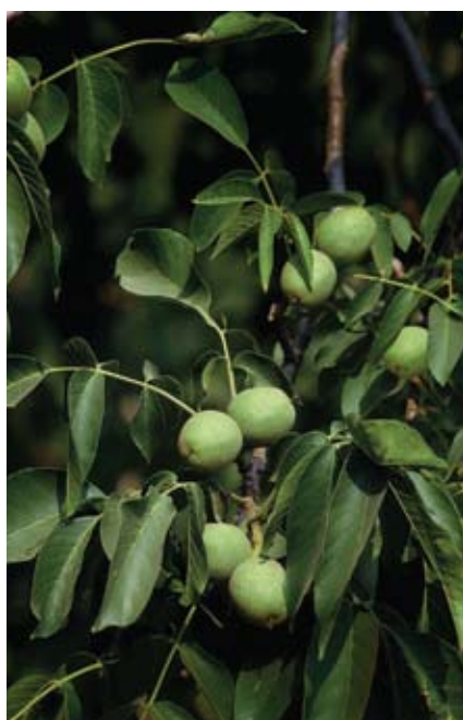
Virtually all the walnut varieties sold in California nurseries are UC Davis varieties.