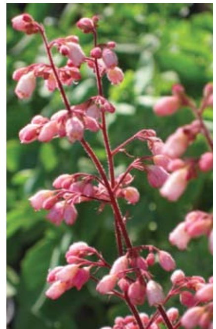
Heuchera "Lilian's Pink"

ticulture in California. Using these "green" plants can help reduce water and energy use in the landscape, reduce carbon emissions from power equipment, reduce chemical runoff, and support native pollinators. It's an easy way for home gardeners to help mitigate the effects of global climate change, and to benefit the long-term environmental, social, and economic health of the planet.