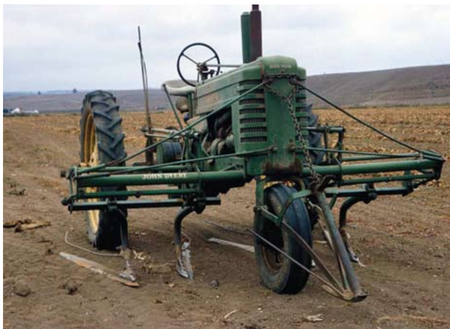
Bean cutting equipment

Beginning in the early 1990s, a shift from public to marketing order support of breeding activities occurred, primarily due to UC budget constraints. UC Davis also