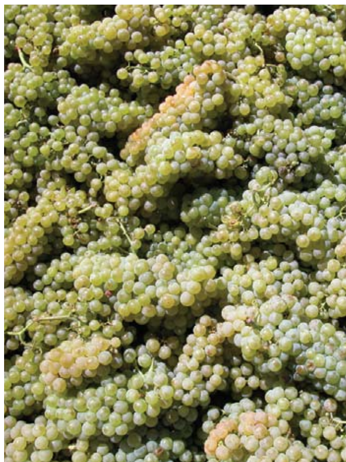
Redglobe and Chardonnay grapes