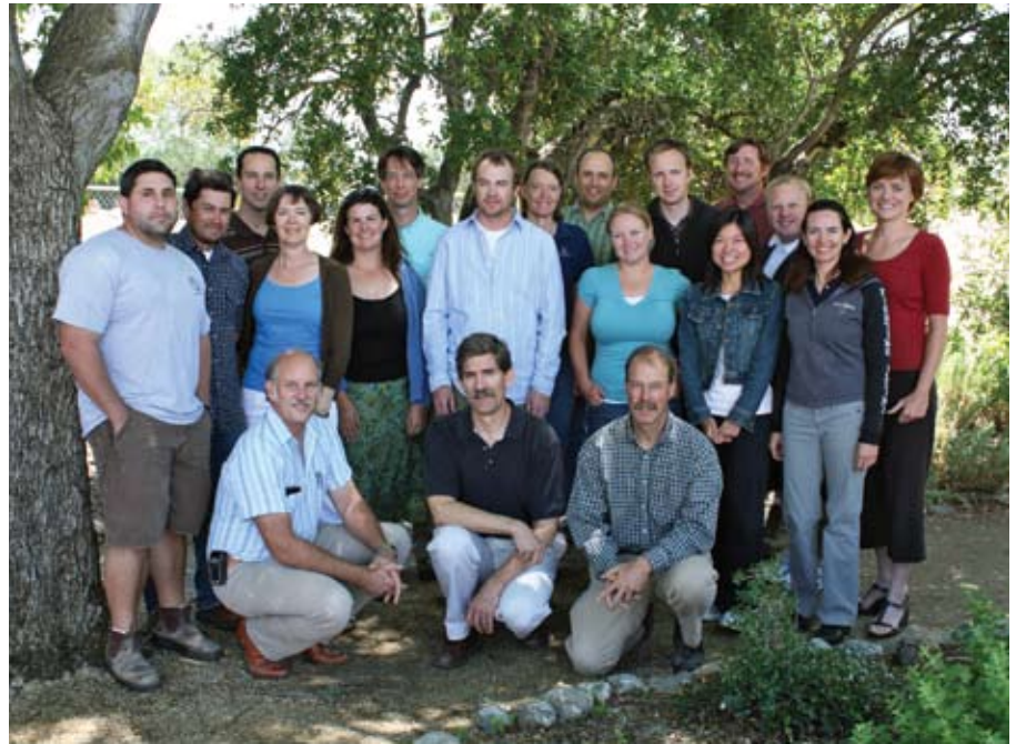
Inaugural class and instructors for the Plant Breeding Academy, 2006-2008.

Plant Breeding Academy began instruction in September 2006 with 15 students. Most were already breeding assistants with practical knowledge in plant breeding but not the theory behind it. They travelled from various locations in North