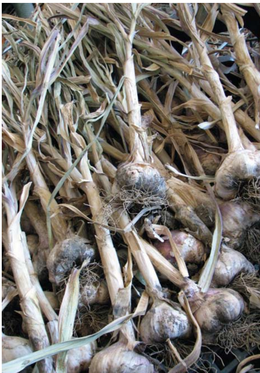
Garlic drying at the UC Davis Student Farm.

UC Davis conducted a garlic selection and testing program for 15 years, until 2004, evaluating over 300 accessions from the USDA and international germplasm banks,