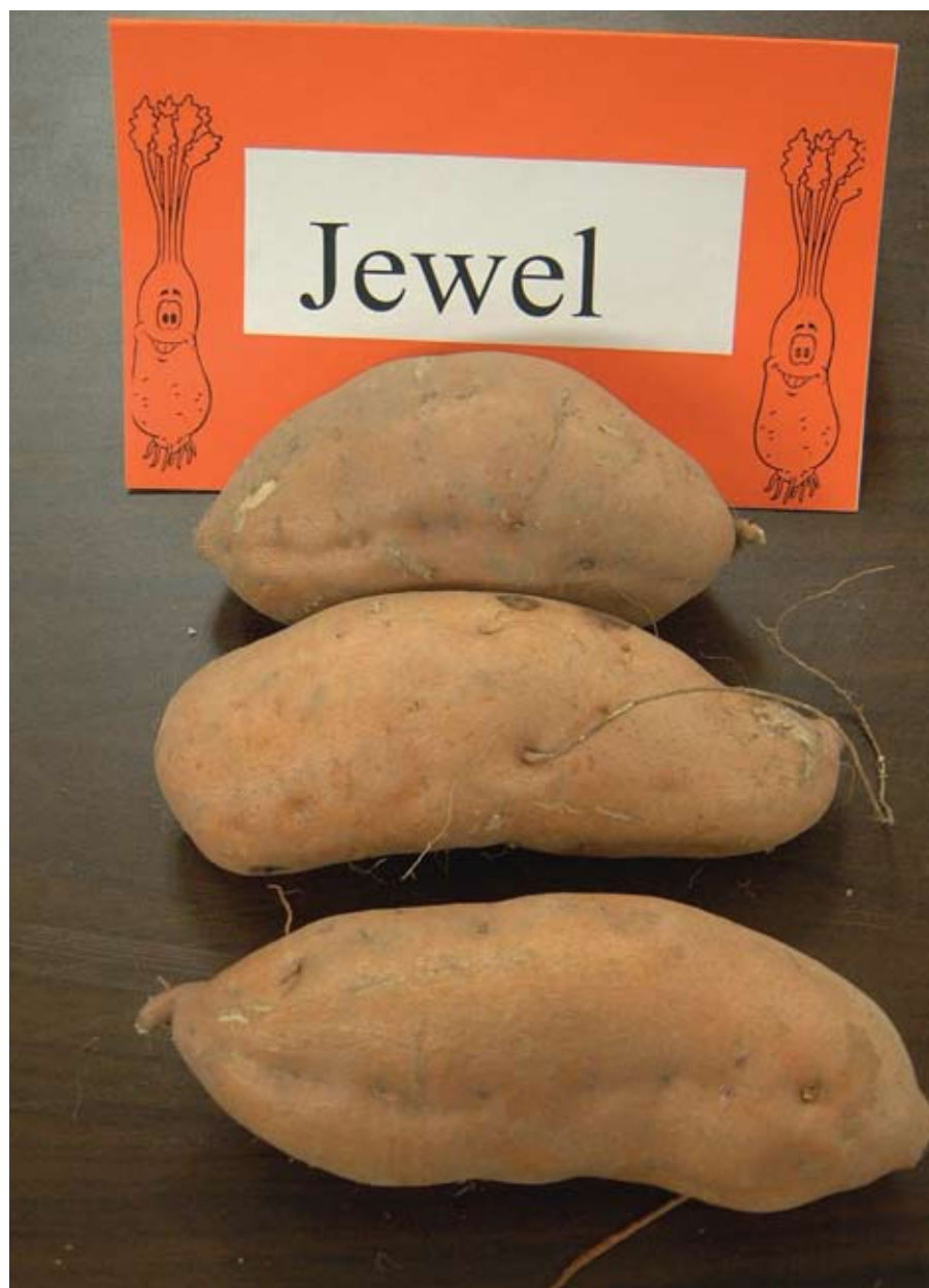
The Jewel type sweet potato, UC7799, was grown exclusively for 20 years in California.

Perhaps the most significant contribution by UC Davis to the sweet potato industry was the development of a clean-seed program and the maintenance of disease-free seed stocks. UC Davis researchers developed the methodology for clean, disease-free seed stock for clonally propagated plants. Shoots from sweet potato are heat-sterilized to eradicate disease, then grown and propagated using tissue culture. These shoots are then transplanted and observed in nurseries for genetic stability and disease. Only plants that are “true to type” and disease-free are carried forward to release as seed stock for California. Deborah Golino manages the Foundation Plant