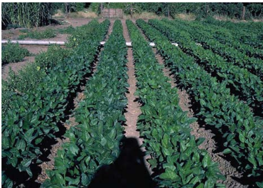
One of the initial grain legumes UC Davis focused on was the cowpea.

yielded primary responsibility for blackeye improvement to UC Riverside breeders, and began a regular germplasm exchange and testing program with USDA/ARS (Pullman, Wash.) for chickpea