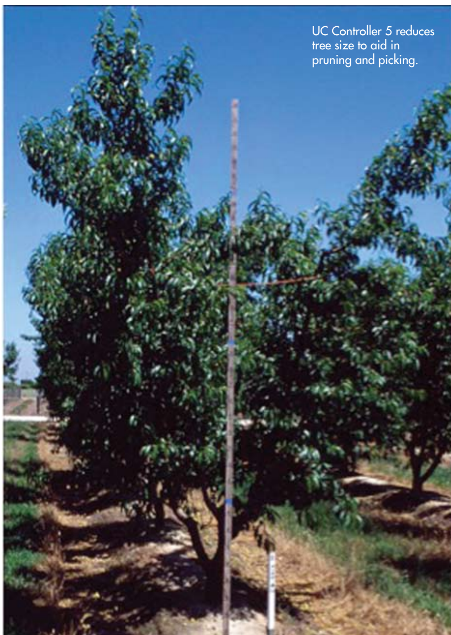
UC Controller 5 reduces tree size to aid in pruning and picking.

Recently a collaborative effort between USDA-ARS and UC Davis