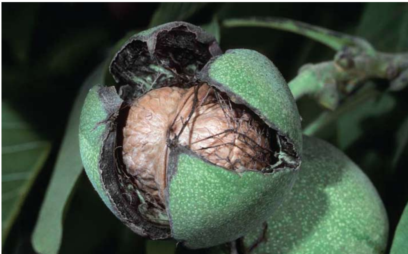
A ripe walnut, ready for harvest.