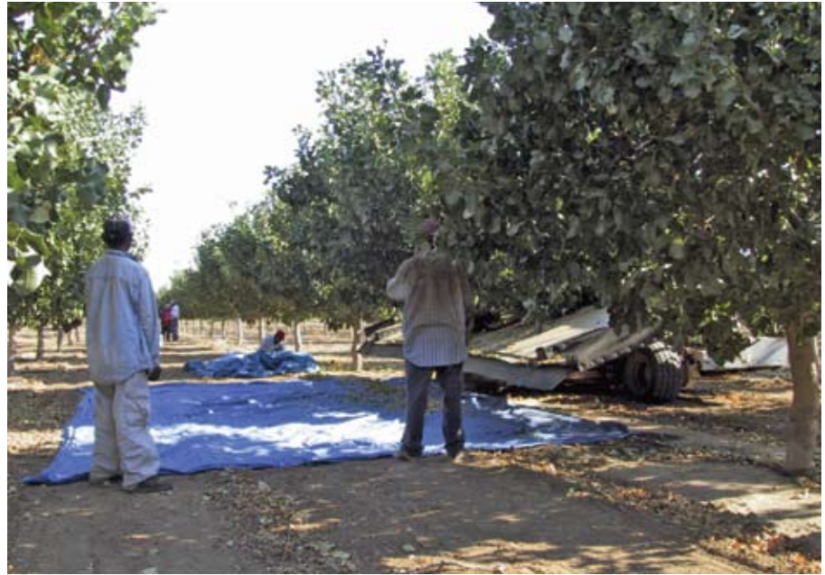
Machines now assist in harvesting pistachios, the third most important nut crop grown in California.

flower earlier and perform better than Kerman under low chilling conditions. Both have significantly higher percentages of split nuts (a desirable consumer characteristic) and marketable yield, and they ripen a few weeks earlier than