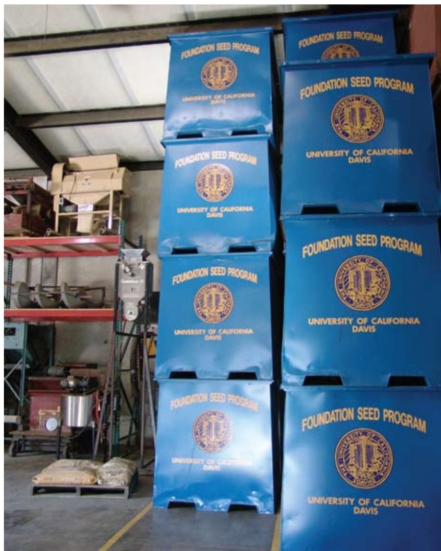
The Foundation Seed Program warehouse at UC Davis

Foundation seed is produced from basic seed stocks (breeder seed) initially supplied by the plant breeder, sufficient to