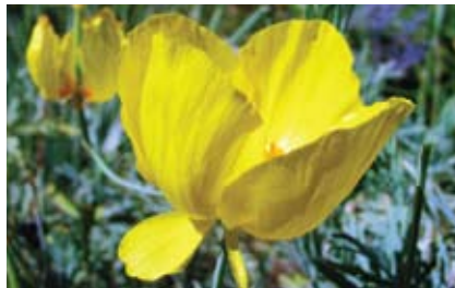
Mexican tulip poppy

ticulture in California. Using these "green" plants can help reduce water and energy use in the landscape, reduce carbon emissions from power equipment, reduce chemical runoff, and support native pollinators. It's an easy way for home gardeners to help mitigate the effects of global climate change, and to benefit the long-term environmental, social, and economic health of the planet.