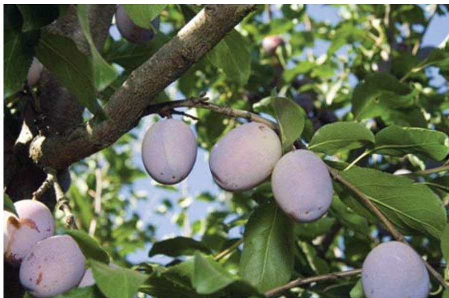
Muir Beauty was released to the dried prune industry in 2004.

A third variety derived from this program, Tulare Giant , produces a very large fruit and was released specifically for the fresh