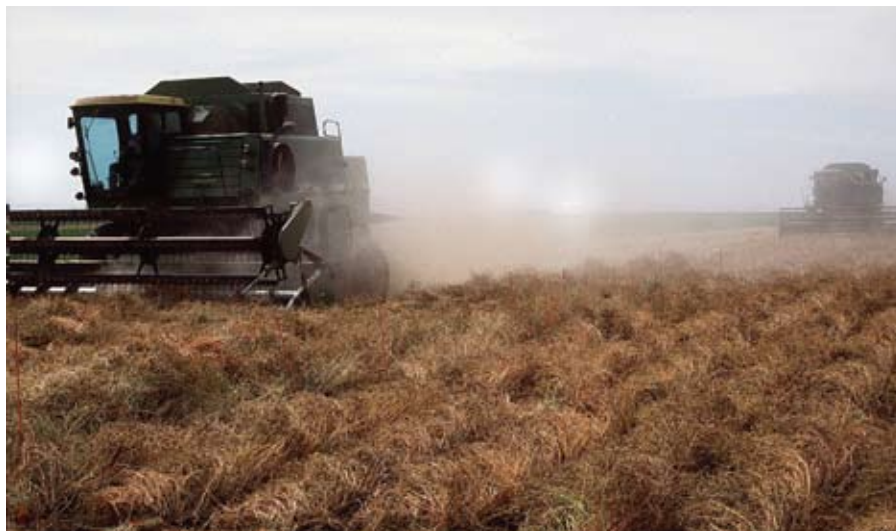
California produces one-third of the U.S. alfalfa seed.