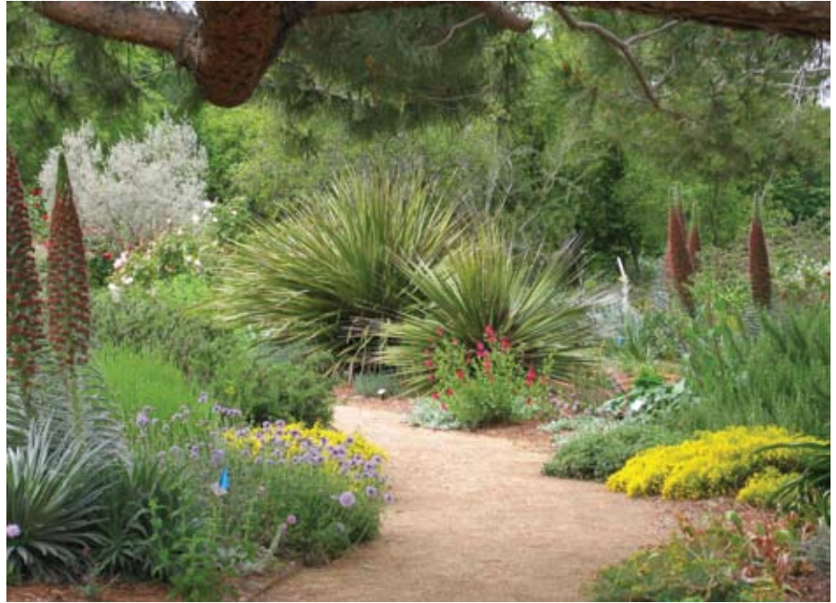
Storer garden, UC Davis Arboretum

The Arboretum All-Stars program is only one facet of the Arboretum's mission to promote sustainable hor-