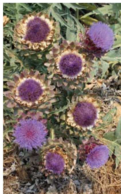
Artichokes in bloom

yields three to four times higher than other varieties when it was developed, especially during winter production. Imperial Star is still one of the most widely grown varieties today.