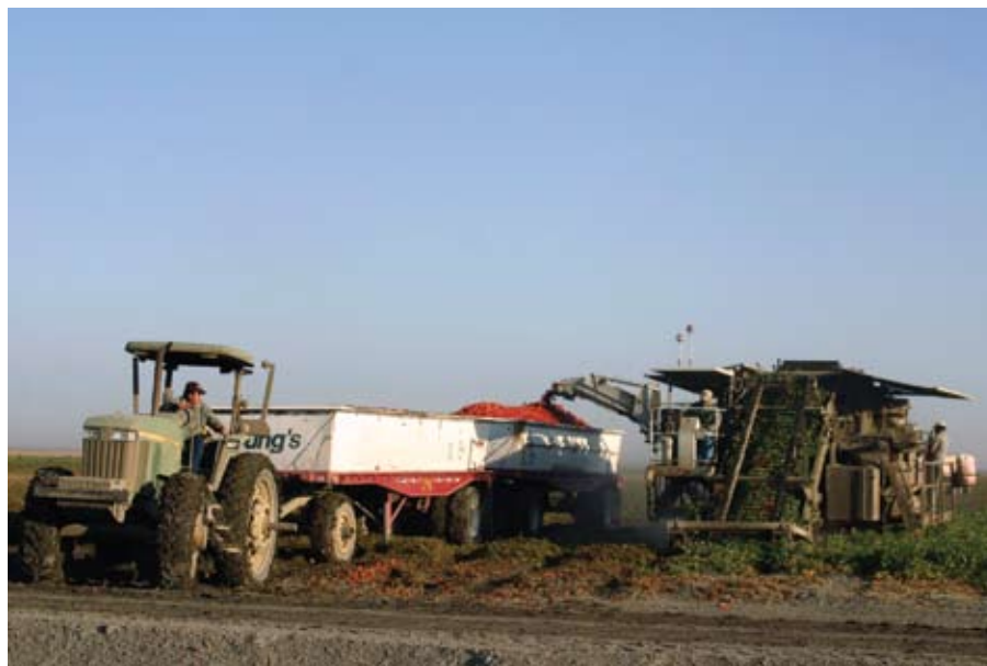
The tomato harvester is a UC Davis innovation.

The coordinated development of the tomato harvester and tomato varieties led to a great expansion of the processing tomato industry in