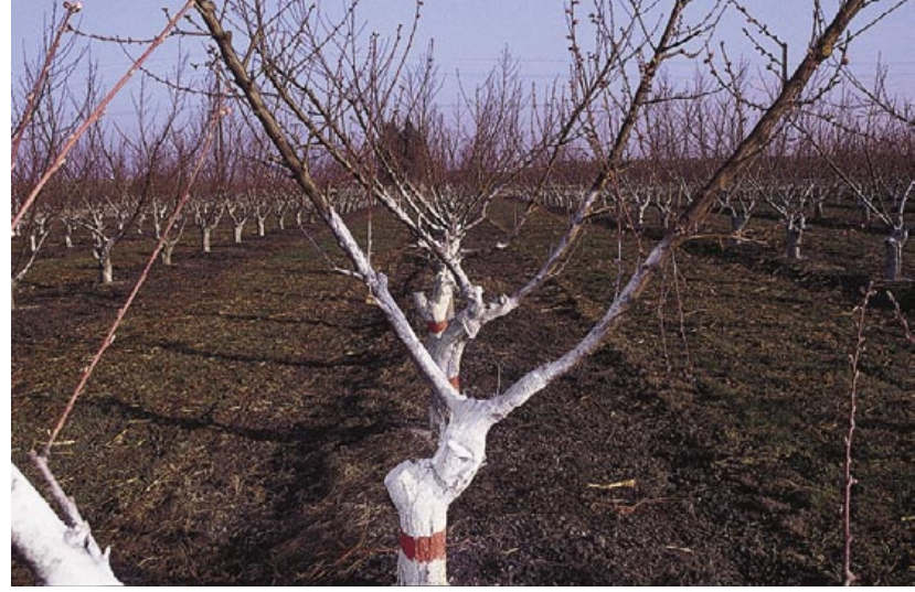
A trial orchard planted in 1982 introduced another alternative for high-density stone fruit orchards, the perpendicular V. This system maintained standard 18-foot row spacing but planted trees about 6 feet apart, affording the advantages of early high yields without the additional cost of new equipment for maneuvering in narrow row middles.

generally did not fit easily into a 12- to 14-foot row, often forcing growers converting to the close-row systems to purchase new equipment.