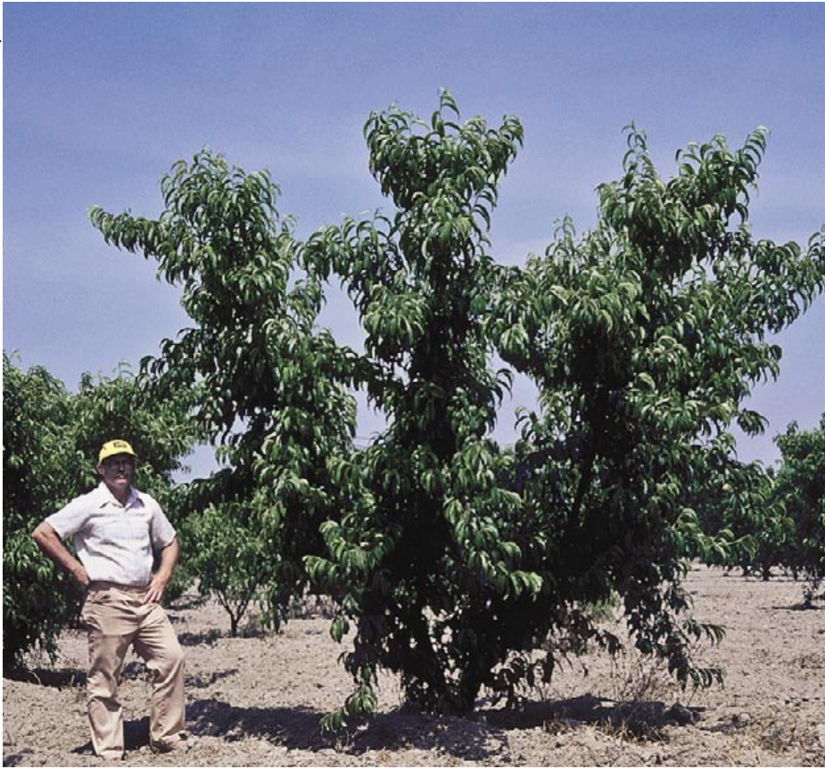
California's tree fruit industry developed shortly after the Gold Rush of the mid-nineteenth century. For many years the state's dominant orchard system was the open vase, with trees trained into a wide "V" shape and ample spacing, allowing for 70 to 90 trees per acre. Above, long-time UC technician Jim Doyle stood next to a standard peach tree in the late 1970s.

stocks to fit a range of orchard needs such as variety, season of ripening, soil type and pH.