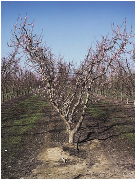
The first high-density or “hedgerow” orchard systems were introduced into the United States from Europe in the 1960s. Top, densities as high as 600 trees per acre were obtained with trees trained to take up less space — a single upright leader (right) or a parallel-V. Increased yield in the early life of these high-density orchards was confirmed by the first UC orchard-systems trial planted at Kearney in 1972.