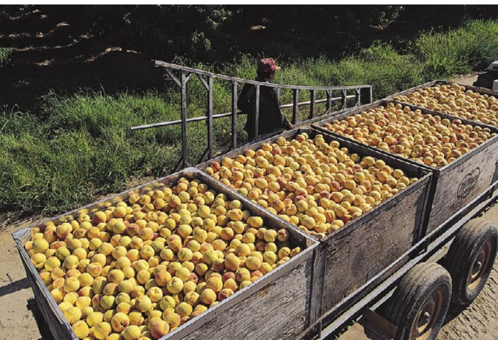
Jack Kelly Clark

'Nemaguard', it should be possible to maintain or increase crop yields with smaller trees using these size-controlling rootstocks.